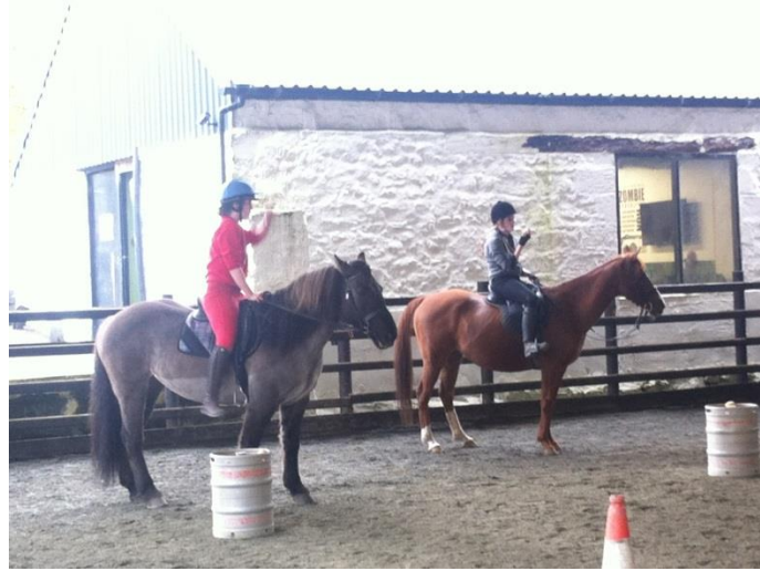
Some young people learning to horse-ride.

Thanks to funding from Better Breaks we were able to run a specific horse riding program for young people with disabilities and additional support needs. This program allowed the children and young people and their carers to get respite from the home on a regular basis. The program saw the participants take part in the national pony club, which meant they got riding lessons, took part in stable management and earned badges as the weeks went on. The program was a great success and allowed some young people to identify skills they did not know they had while also getting out and about with peers on a regular basis.