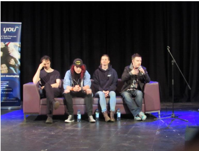
Our Music Ambassador (with cap) at the Development Day Panel.