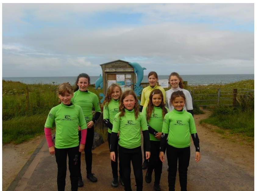
All ready to go.