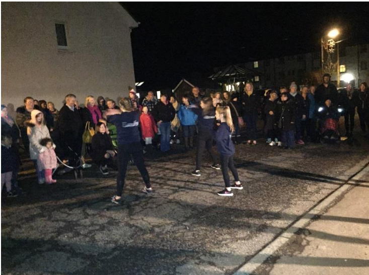
UNIEK Performing for the crowd

At the beginning of December we were delighted to be asked to perform at the local Christmas light switch on. Members of our JAM music group, our Big Music Champions and UNIEK dance group all performed throughout the evening. With plenty of music from Christmas favourites to golden oldies the local community came out in force to support the young people and see the lights get switched on. Even I (MAYDS Manager) was convinced by the young people to get on the stage to give a rendition of “Rocking around the Christmas Tree”. The young people did a great job and the night was a success all round. We look forward to performing again next year.