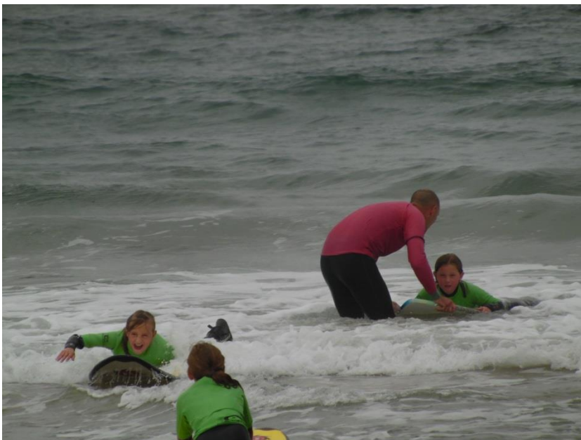
In the Water