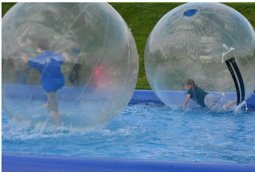
Fun on the Water Walkerz