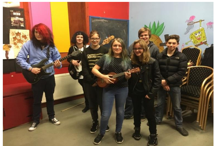
Some of our Music Champions.