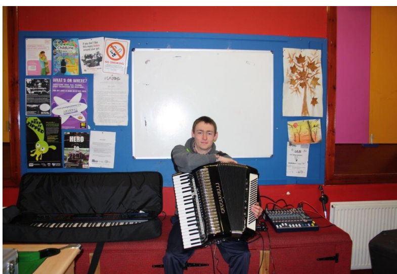
Our young accordion player attended this year's tenancy program.

Once again, thanks to funding from the Kilfinan and Robertson Trusts, in 2016 we were able to run two Tenancy Support Programs. During the course of these programs young people struggling in their tenancies or about to embark into new tenancies attended a 12 week course. The course covered everything from budgeting, cooking on a budget and home safety to employability, health, being a good neighbour, drugs and alcohol etc. At the end of each course those in attendance got their first aid and food hygiene training. Those attending this year's course varied from young parents to those with additional support needs and care leavers. All the young people attending found the course invaluable in teaching them new skills, widening their network circles and meeting new peers they will continue to connect with in the future.