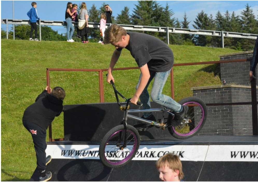
Unit 23 Skate Park