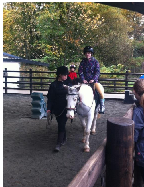
Some of our budding riders.