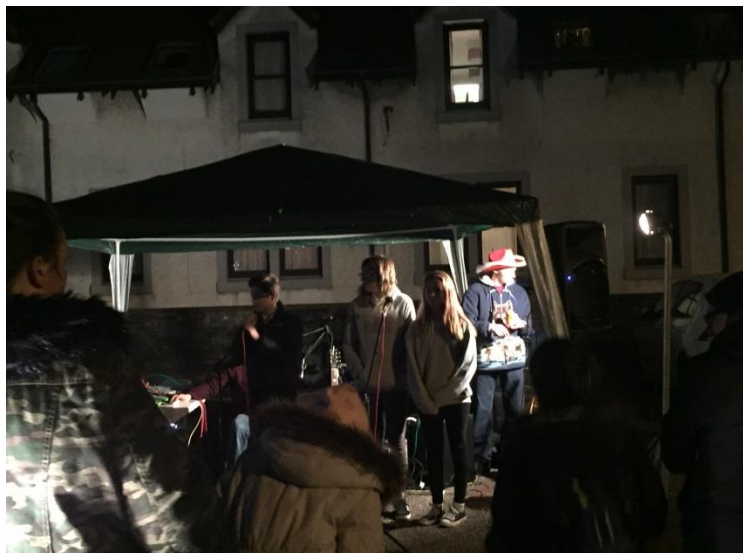
Some of our JAMMERS getting ready to perform.