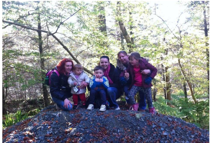
Some of our Young Parents at Blarbuie Picnic.