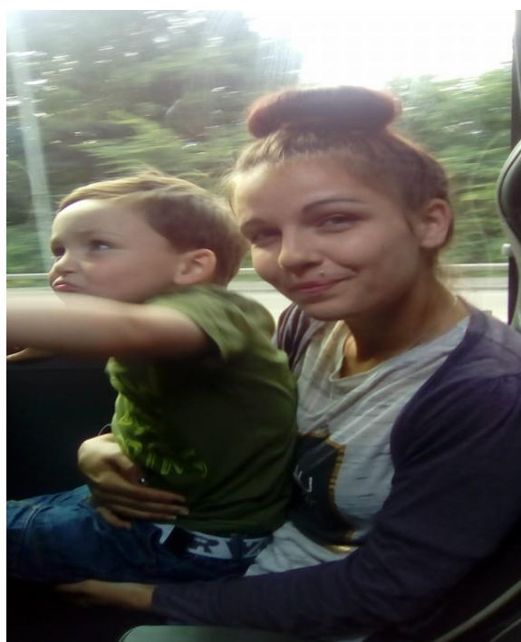
One of our young parents who attended the course.